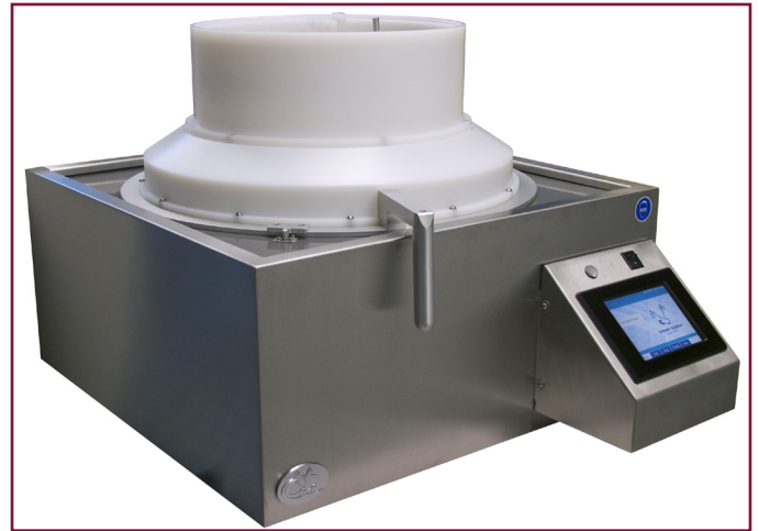
Cee® 300XD with direct-spray chimney hood option

©2017 Cost Effective Equipment, LLC. All statements, technical information and recommendations contained herein are based on tests we believe to be accurate, but the accuracy or completeness thereof is not guaranteed and the following is made in lieu of warranty expressed or implied. Neither the seller nor manufacturer shall be liable for any injury, loss or damage, direct or consequential, arising from the use or inability to use the product. Before using, user shall determine the suitability of the product for his intended use, and user assumes all risk and liability whatsoever in connection therewith. No statement or recommendation not contained herein shall have any force or effect unless in an agreement signed by officers of the seller and manufacturer.